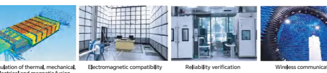
Simulation of thermal, mechanical, electrical and magnetic fusion | Electromagnetic compatibility | Reliability verification | Wireless communication